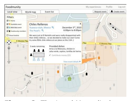
Figure 2 . The Local Map: displaying a snapshot of the user's community.