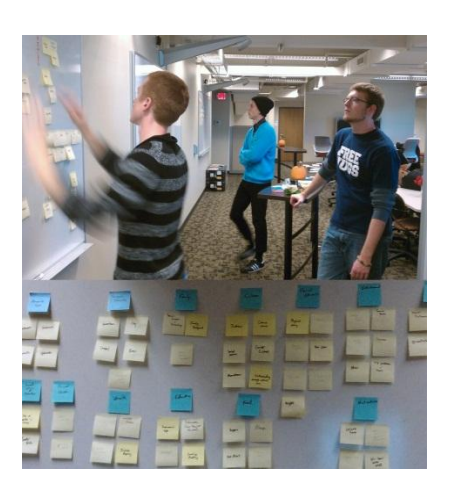
Figure 1 . Affinity diagram: developing our definition of diversity.