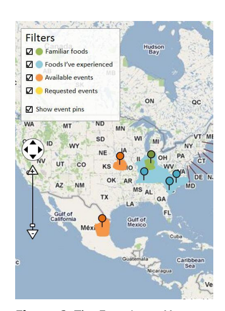
Figure 6 . The Experience Map offers a visualization outlining the experiences users have had through Foodmunity.

had more experiences attending events within their community. Confusion regarding the utility of the darkened areas in usability testing led us to instead present events through a heat map metaphor, highlighting areas users have experienced. This screen also led us to focus on security, which is an important consideration in any system that attempts to introduce strangers [2]. New users are gradually introduced to events, with events at homes where users have more positive rankings suggested first. Feedback is visible to all users, available wherever user profiles are displayed. Formal complaints can be filed by users, and feedback can be left anonymously if needed.