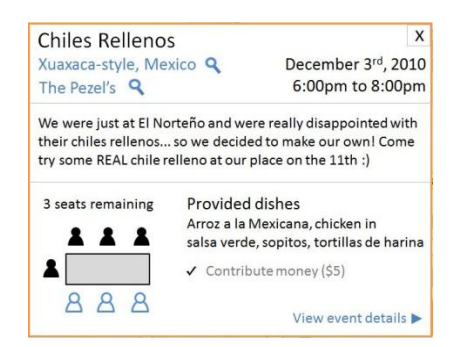
Figure 4 . A callout screen from the Local Map, displaying basic event details.

Winship describes diversity: "our own identities—racial, gender, social class, and others" [8]. Differences are the many aspects that make individuals unique, and "diversity" arises when those individuals are viewed collectively. The problem, however, is that these differences can be deeply hidden. The challenge became to find a way to bring people together in a situation that would open them up to sharing their differences in a meaningful manner. We arrived at the notion of using food as something that can serve as both a cultural representation and a method of bonding.