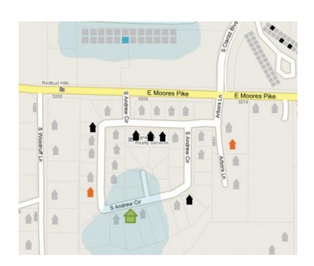
Figure 3 . A closer view of the Local Map.