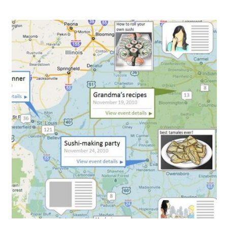
Figure 7 . Zooming in to the Experience Map provides event details and conversations that have occurred.

motivating factor for them attending events in the future.