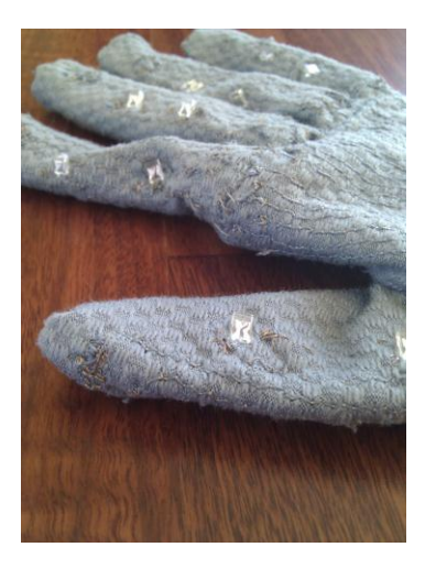
Figure 2: Detail of LEDs on a prototype.