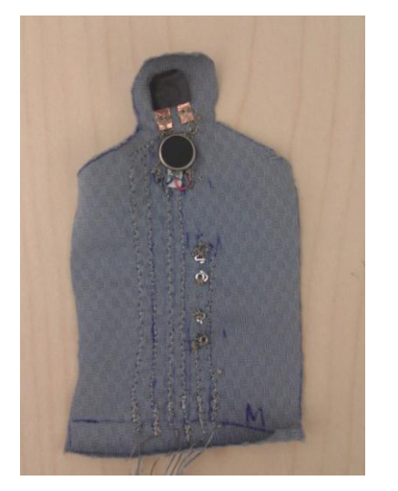
Figure 3: Components in the prototype.

We constructed a new glove pattern designed to hold a dense network of sewn circuits. Each glove finger had a custom-built Force Sensing Resistor (FSR) sewn into the fingertip, an array of LEDs with a different colour for each finger, and a small vibration motor placed just below the fingernail on the top of the finger [9]. The glove was then connected to an Arduino, which communicated to a laptop running Processing over a serial connection to drive the interaction.