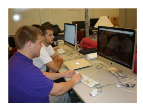
Figure 8 – A team member observes a potential user as he comments on the full prototype

comment" button instead of simply making comments linkable, as users struggled with how to reply to comments. Other suggestions included making the menu easier to see and buttons easier to push. Overall, users enjoyed the site and thought it would increase communication about differences in others.