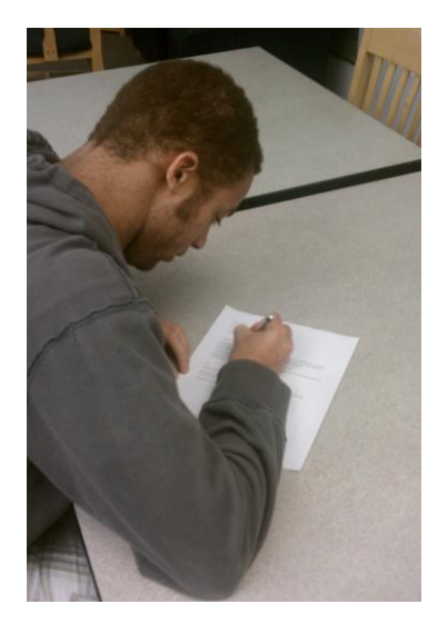
Figure 2 – A survey participant writes about stereotypes that affect him as he sits in the food court of a local mall.