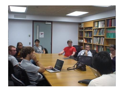
Figure 3 – A focus group discusses their ideas about the system

Another key aspect in these social networking sites is a karma system. Karma systems can develop a sense of trust in users [6]. Building this trust and establishing so-called "social capital" through karma and other methods of interaction and feedback can affect a user's ability to remain connected within a community and participate in a group [7]. Many online communities include karma systems, such as Reddit's up- and downvote, YouTube's thumbs-up and -down, and Facebook's like.