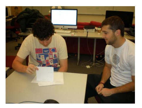
Figure 4 – A team member listens as a potential user comments on a paper prototype