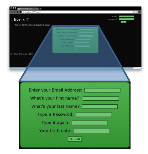
Figure 6 – DiversIT's registration page requires minimal data input to speed up the registration process and encourage more users to join